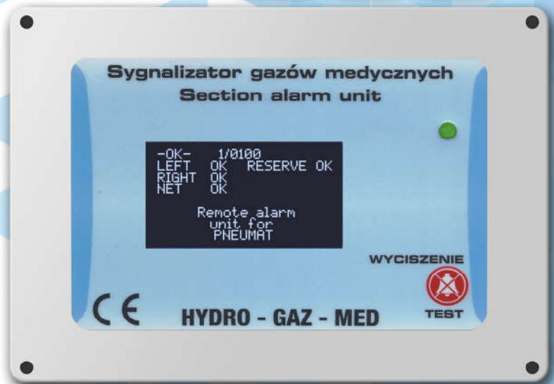
Remote alarm unit