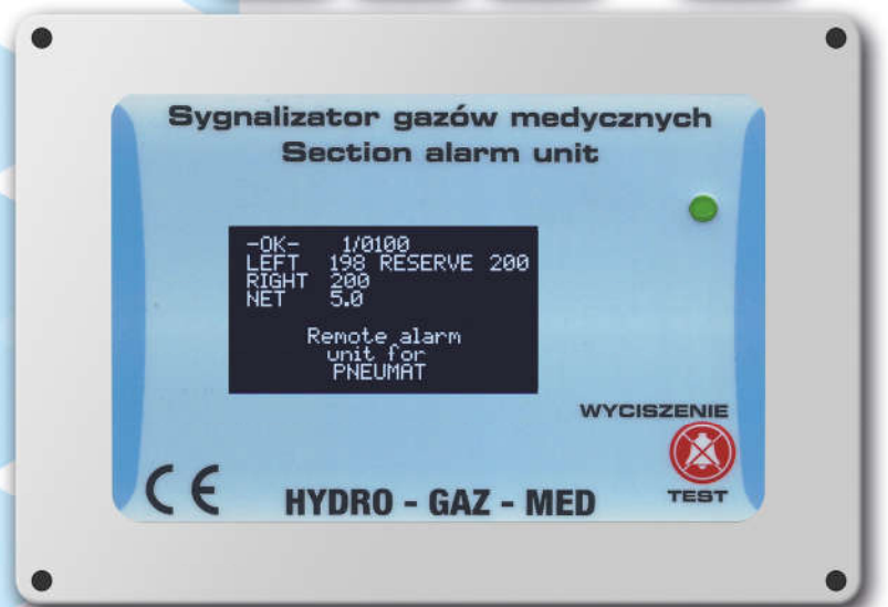
Remote alarm unit