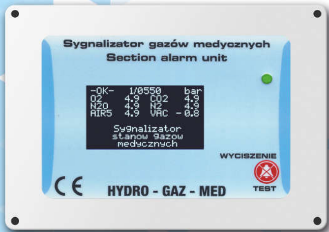
On-plaster alarm unit