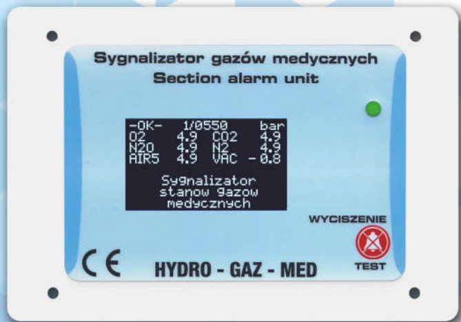
Under-plaster alarm unit