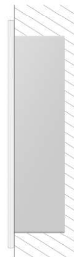
Dimensions (WxHxD) 174x137x5 (mm)