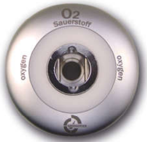
System AGA SS 875 24 30