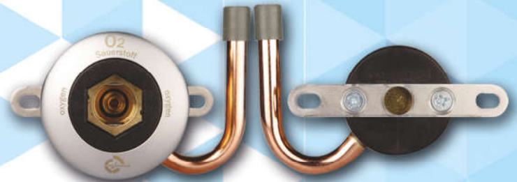
Gas outlet for bed-head units