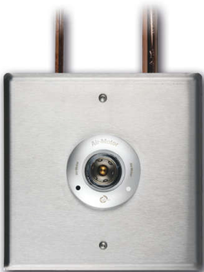
For compressed air driven surgical tools AIRMOTOR