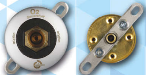
For ceiling pendants with hose connection