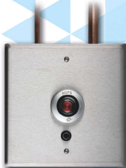
For AGSS, Venturi type