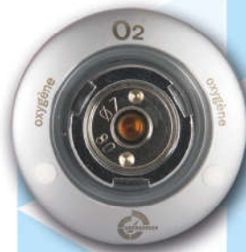
System NF S 90-116