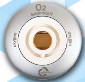
System BS 5682