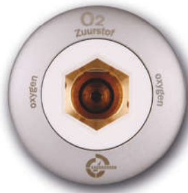
System DIN 13260-2